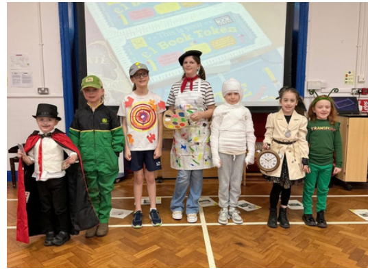
World Book Day – Take One Word Theme

As part of LLR Girls' Football Week, we were delighted to welcome Asfordby Amateurs Ladies and Girls Football Club, who delivered a fantastic girls' football session for our KS2 pupils today. The session supported the ambition to ensure all girls have equal access and equal opportunities to take part in football, building confidence, skills and enjoyment of the game. A huge thank you to the coaches for inspiring our girls and helping us champion equality in sport! Melton & Belvoir School Sport and Physical Activity Network