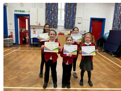
Year 3 Cross Country Finals