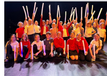
Skye Dance Show