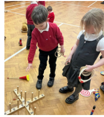
Chestnuts exploring the Travelling Toyshop