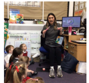
Dental Nurse visits to Willow and Chestnuts