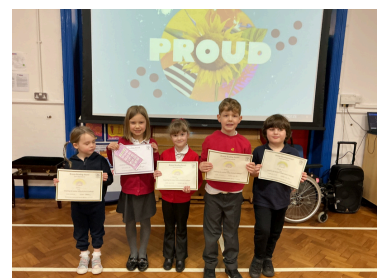
Congratulations to those who received their reading awards.