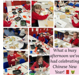
Holly and Willow classes Lunar New Year creative afternoon