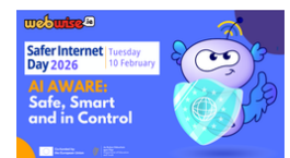
Safer Internet Day across the school