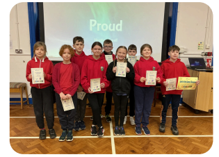
Our basketball awards and spirit of the games.