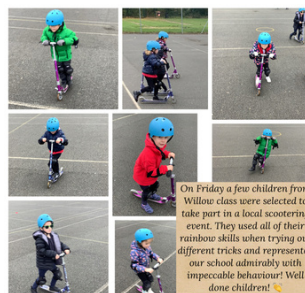
On Friday a few children from Willow class were selected to take part in a local scootering event. They used all of their rainbow skills when trying out different tricks and represented our school admirably with impeccable behaviour! Well done children! 🙌