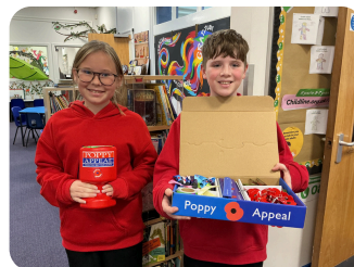
Year 6s collecting for the Royal British Legion