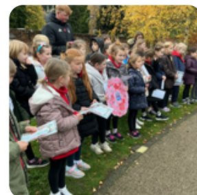
Year 3s representing the school at the Memorial Green in Asfordby for Remembrance Day.