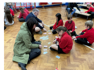
There was a great turn out for the Year 4 timetables workshop for parents with lots of ideas for practicing at home.