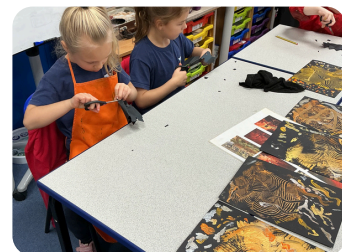
Year 2s creating a piece of art using printing skills for the Great Fire of London