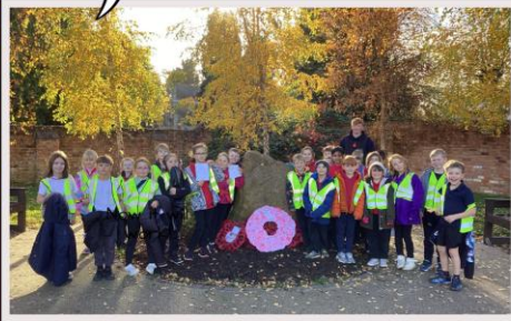
Rowan class visited the Memorial Garden in Asfordby for Remembrance Day