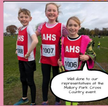
Well done to our representatives at the Mallory Park Cross Country event.