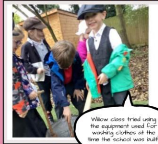
Willow class tried using the equipment used for washing clothes at the time the school was built!