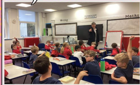
Year 5s and 6s had an inspiring talk about money matters from Money Sense