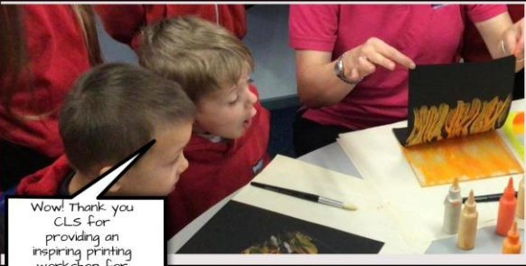
Wow! Thank you CLS For providing an inspiring printing workshop for Holly Class